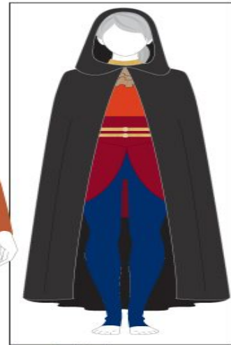
43790 - Black Plush

COLORS USED RED PLUSH VELVET GOLD MYSTIC JEWELS PARTIAL SATIN SPANDER COPPER SATIN SPANDER TRUESKY HATTO SPANDER NUDE GLITTER POWER FOL